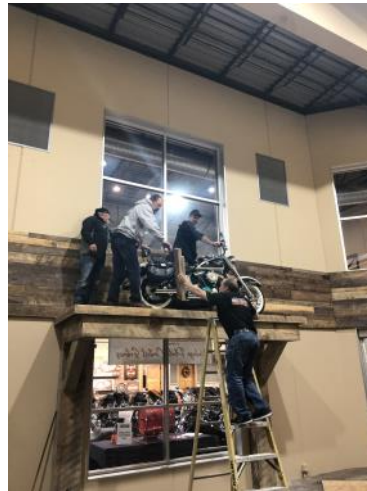
Moo Glide on display in the entrance. Put up the night before Grand Opening!

A few brave souls ventured out by motorcycles to attend Bull Fall's Grand Opening while others took car. Per Director, Greg: FYI, rain tickles the senses at 70 mph.