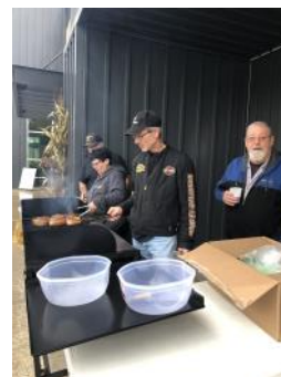
Wausau Chapter fried the brats