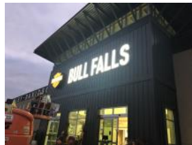
Lettering for the new name now lit up