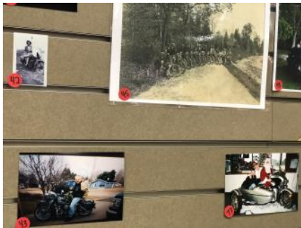
Photo of Vintage years contest