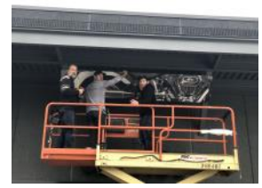
Installing outdoor graphics - 3 generations!