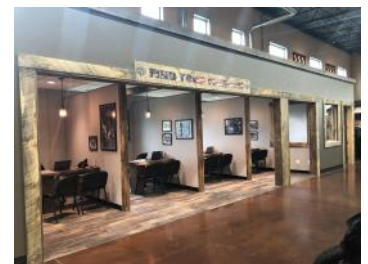
New sales offices - desks hand built by Rob Kane- Bent Construction