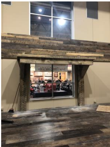
The Framework is done for the bike display