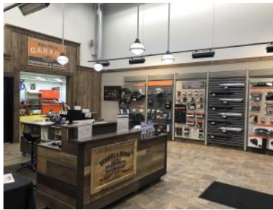
Newly remodeled service entrance