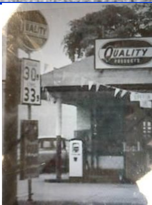
Gas Station in the Post - -- .30/gallon