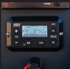
KICKER SSV AUDIO SYSTEM

See the full line at TextronOffRoad.com .