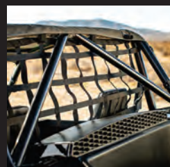
SOFT HEADACHE NET