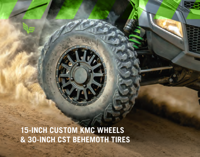
15-INCH CUSTOM KMC WHEELS & 30-INCH CST BEHEMOTH TIRES