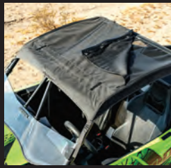
DELUXE BIMINI TOP