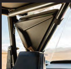
ROPS STORAGE CASE