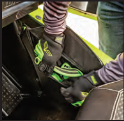
DOOR STORAGE CASE