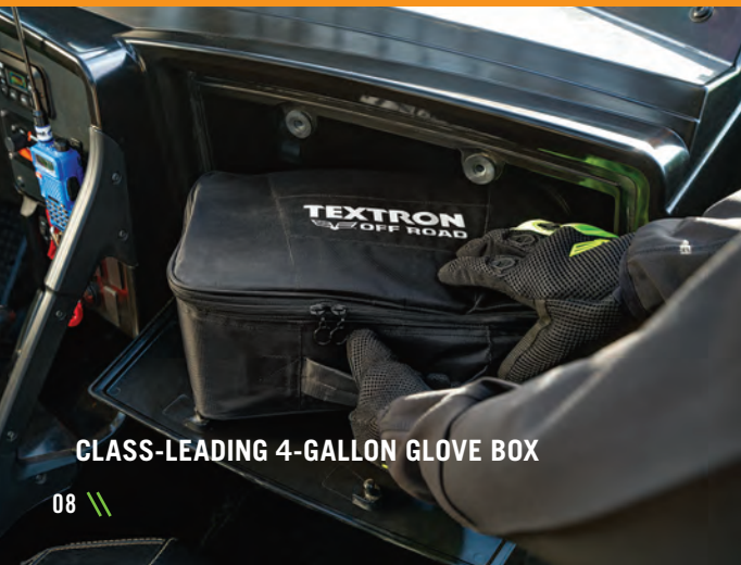
CLASS-LEADING 4-GALLON GLOVE BOX

There's more to a great ride than suspension, shocks and precision engineering. It takes a lot of little things — which is why every inch of Wildcat™ XX is designed with the driver in mind.