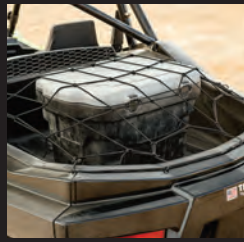
BED STORAGE NET