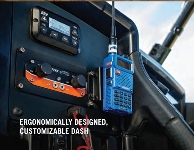
ERGONOMICALLY DESIGNED, CUSTOMIZABLE DASH

There's more to a great ride than suspension, shocks and precision engineering. It takes a lot of little things — which is why every inch of Wildcat™ XX is designed with the driver in mind.