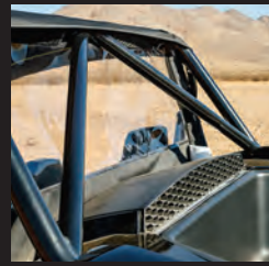
SOFT REAR WINDOW