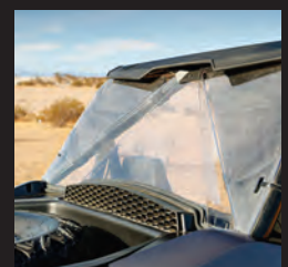
HARD REAR WINDOW