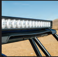
36-INCH LIGHT BAR